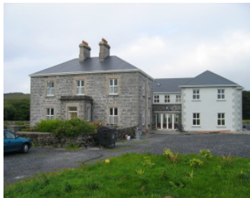
Kilmurvey House, Inis Mór Small, very comfortable *** guest-house with friendly landlady and delicious food