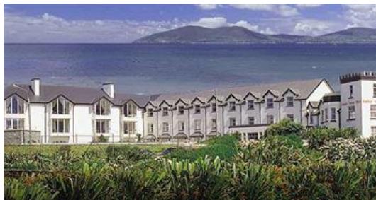
Butler Arms ****Hotel, Waterville is one of Co. Kerry's best known family run hotels. It combines a luxurious, welcoming atmosphere with a local touch and an excellent cuisine