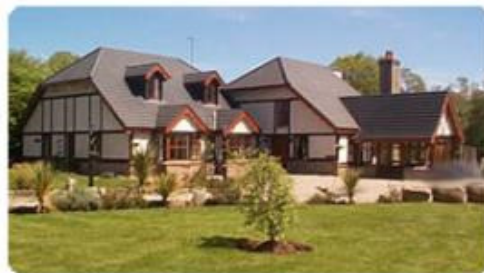
Tudorlodge, Laragh luxurious ****B+B, quiet surroundings, near the monastery of Glendalough