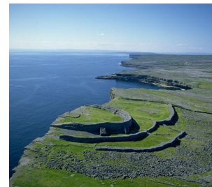
Dun Aonghasa Insi Mór

Additional nights can be booked: on Inis Mór, in Galway and Westport from Euro 60.-/night B+B sharing . I can not guarantee that I will find extra rooms, specially singles or just for one night in Galway. Most of my B+B's are closed. I will try my best.