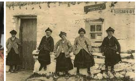
The Petticoat boys from Inishark, 1915