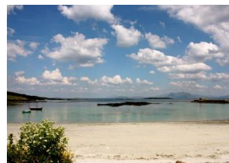
Beach on Inishbofin